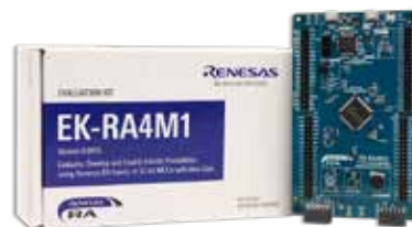
Evaluation Kit: EK-RA4M1